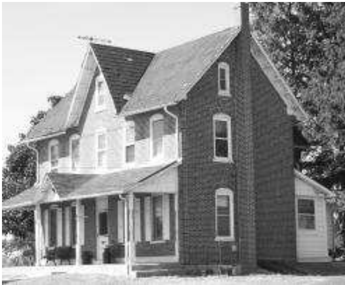
This brick farmhouse on Berks Road, one of only a few left in Worcester, was demolished earlier this year.

Nothing can replace a historic building. Once it is torn down, the stories it represents are gone along with it. Our historic buildings remind us of the individuals and families who founded and built this community in the 1700s and 1800s. Their architecture chronicles the changes brought by the Victorian era and the austerities of the Depression. They evoke community stories in ways that newer structures cannot. They form our connection with the past. Without them, Worcester would resemble any other collection of suburban housing developments, distinguishable only by our zip code. It is the duty and responsibility of the township to protect our historically significant resources. FOW strongly supports the efforts of the Historic Structures Preservation Committee and the supervisors' role in protecting our historic resources. 🌱