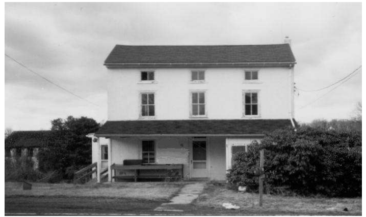
The circa-1885 Insull family farmhouse on Trooper Road (above) and the early-20th-century barn (below) prior to demolition in 2005.

Currently, our ordinances have no provisions to prevent a historic structure from being demolished. The recommended ordinance will include the steps by which an applicant must proceed with a demolition request. There are also incentives for continued use of the historic resource, and provisions by which the resource can be appropriately or adaptively reused and preserved. This ordinance will not affect the interior or exterior features of individual historic properties.